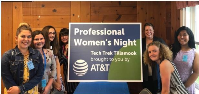
Girls from Tech Trek Camp at Professional Women's Night, supported by a grant from AT&T.