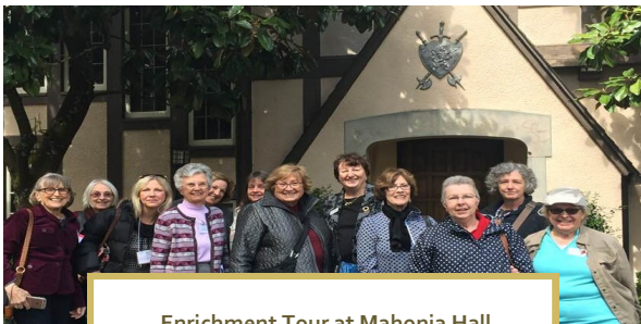
Enrichment Tour at Mahonia Hall

Thank you for being part of AAUW and doing all you can to make our organization strong and viable in its efforts to empower women and girls in the 21 st century.