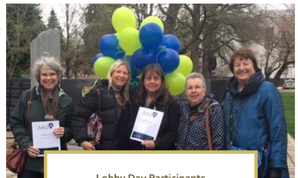
Lobby Day Participants