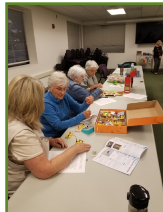
April brought a wide variety of educational tools.