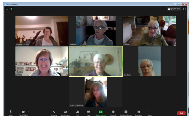
Some of our Board Members at the June 9, 2020 Board Meeting done via ZOOM.