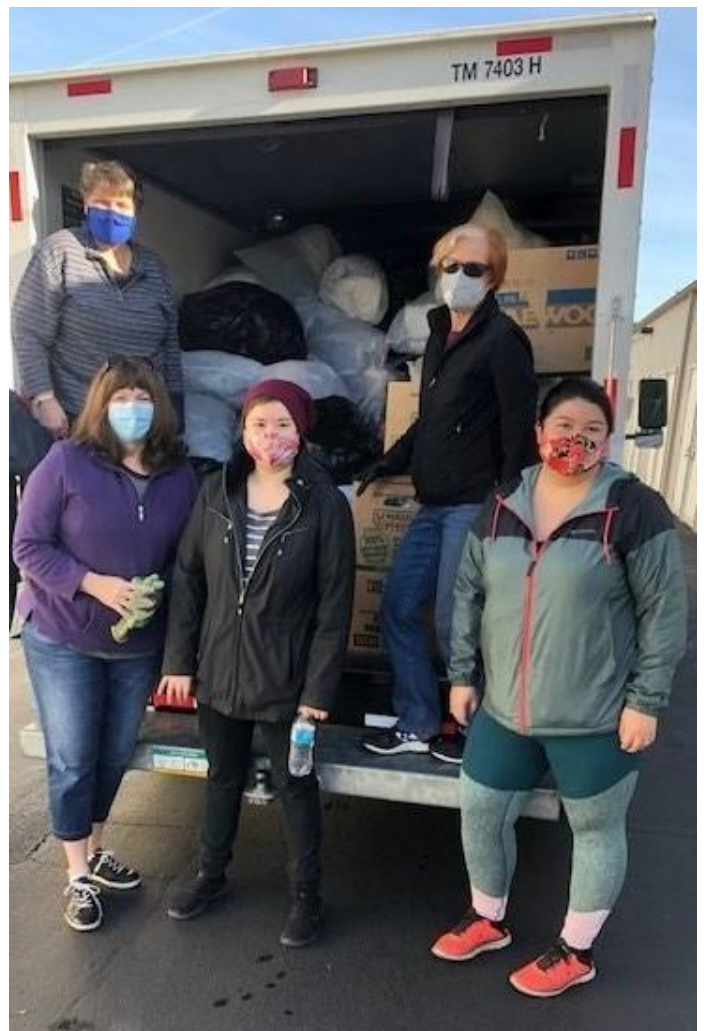
Tigard Area Branch "Clean Closets for College"