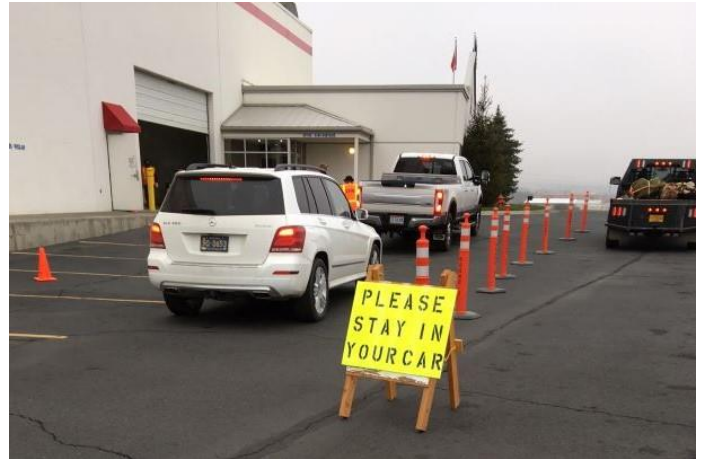
Pendleton Branch "Grapefruit Sale"