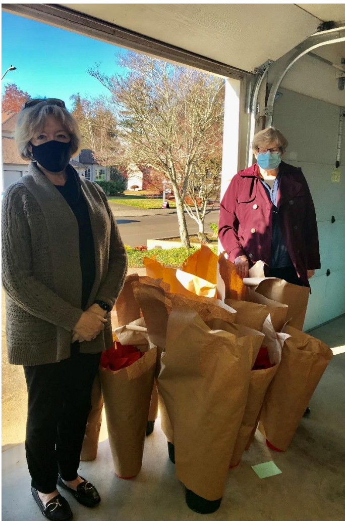
Hillsboro-Forest Grove Branch "Poinsettia Sale"