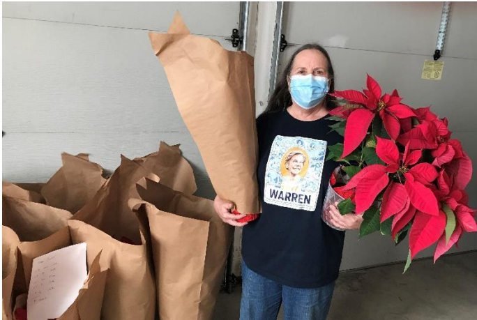
Hillsboro-Forest Grove Branch "Poinsettia Sale"